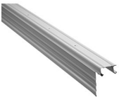
Bypass Door Top Track with Fascia