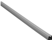
Style D Rails Product # 145R096WIP