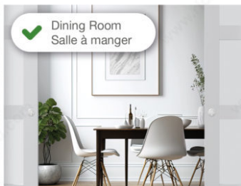
✓ Dining Room Salle à manger