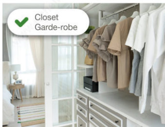
✓ Closet Garde-robe